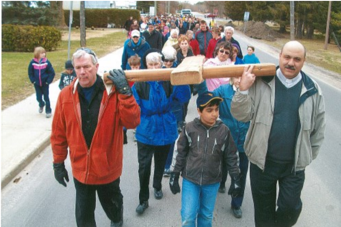
Members of St. Paul's participated again this year in the Good Friday Walk of the Cross that went through Kemptville, stopping at many of this community's churches along the way. It was a great turn-out and thank you to everybody who took part.